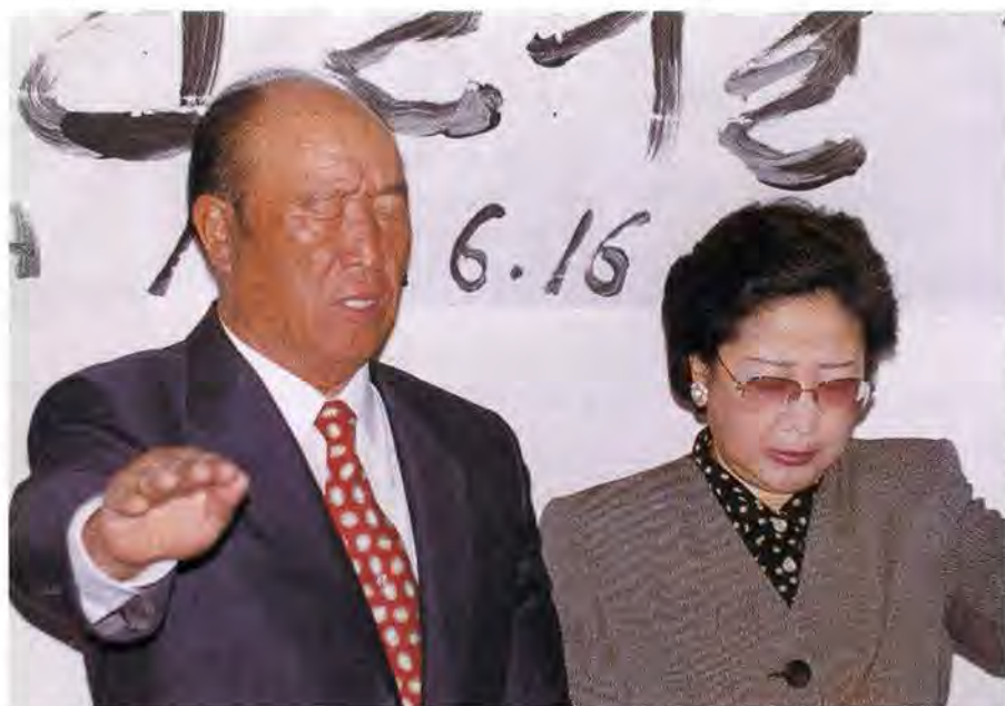
True Parents' prayer for the 34th True Day of All Things in Karluk, Alaska. June 16, 1996.

I urge you one thing: the media and even our own members criticize True Children, but please do not do it. True Parents' victorious foundation is historical; they solved in one stroke, with one proclamation and benediction, the original sin of 720,000 people.