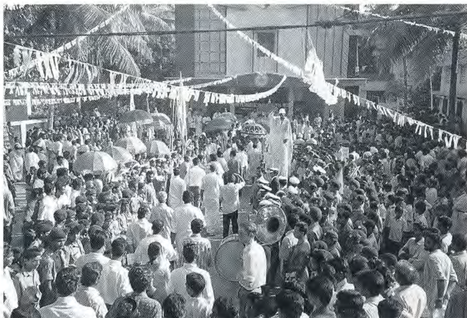
Over 5,000 gather at the opening RYS rally.