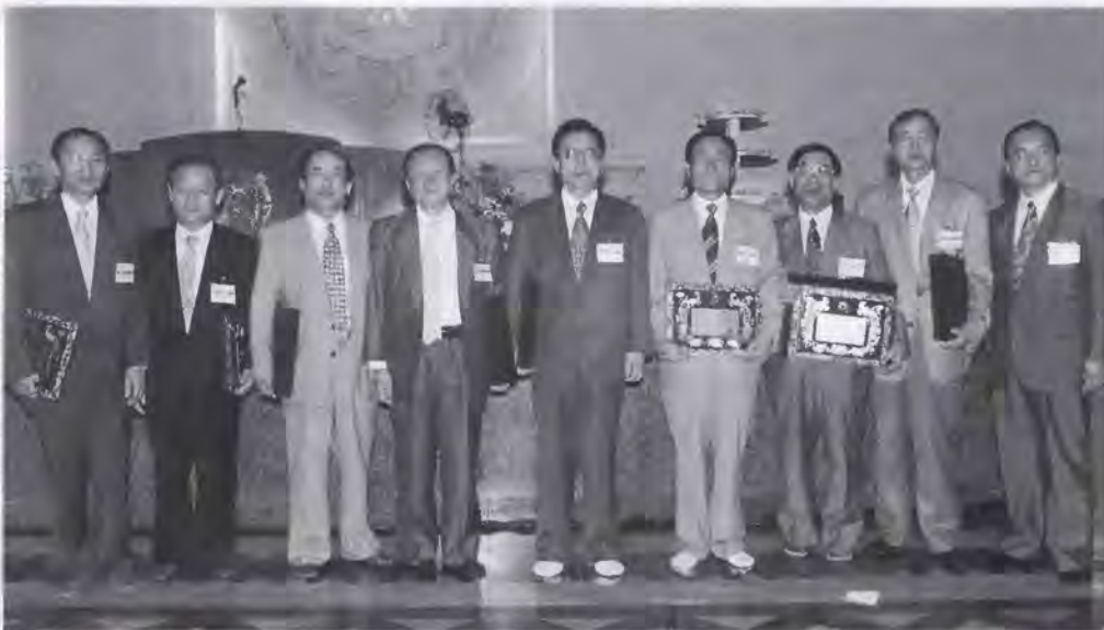
Korean and Japanese leaders who were given awards by True Parents on True Parents' Birthday.