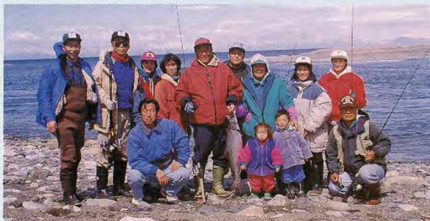
Above: Members of the True Family take a group photo with leaders. Center: On True Day of All Things Father and Mother enjoy an outdoor lunch.

“The process of God’s creation was centered on love; all things long for human love and human beings long for God’s love. Even when a salmon gets caught and sheds blood, it rejoices because it can be assimilated into the higher human love.”