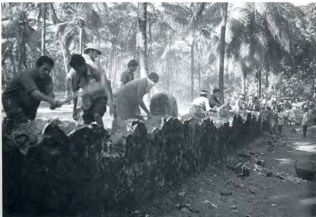
The work portion of RYS began with the goal of widening 1.2 km. of road.